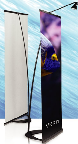
Vertimax V1 System Size: 75.5cm (W) x 203cm (H) x 32cm (D) Artwork size: 74.4cm (W) x 202cm (H) *single 75.1cm (W) x 202cm (H) *joining Weight: 5kg