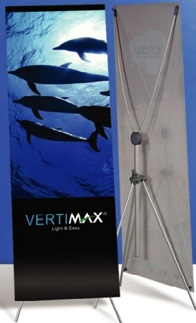
Vertimax X600 System Size: 100cm (W) x 200cm (H) Artwork Size: 88cm (W) x 200cm (H) Weight: 1kg