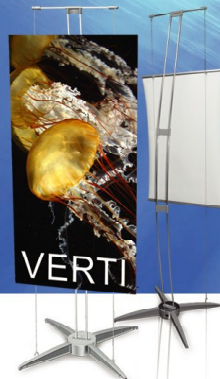
Vertimax T2 System Size: 60.5cm (W) x 208cm (H) x 57cm (D) Artwork size: 59.6cm (W) x 90 (H) *adjustable height Weight: 7.6kg