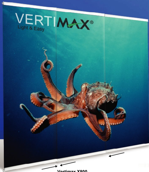
Vertimax X800 System Size: 90cm (W) x 210cm (H) x 32cm (D) Artwork Size: 89cm (W) x 210cm (H) *single 89.5cm (W) x 210cm (H) *joining Weight: 5.65kg *Straight model available only