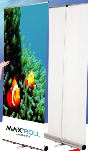
MaxRoll G2 System Size: 85cm (W) x 210cm (H) Artwork Size: 84.5cm (W) x 210cm (H) Weight: 4.2kg