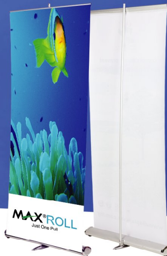
MaxRoll G3 System Size: 85cm (W) x 210cm (H) Artwork Size: 84.8cm (W) x 200cm (H) Weight: 5kg