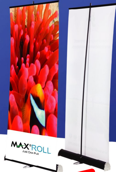
MaxRoll G4 System Size: 85cm (W) x 210cm (H) Artwork Size: 84.8cm (W) x 201cm (H) Weight: 4kg