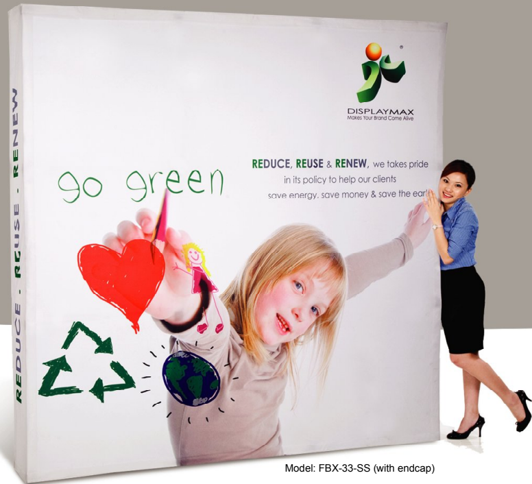
Model: FBX-33-SS (with endcap)

The FabriMax is a pop-up system with a seamless fabric graphic always attached to the frame, using Velcro. When the unit is set up, the graphic unfolds with the frame and stretches to form a completely smooth image across the entire display.